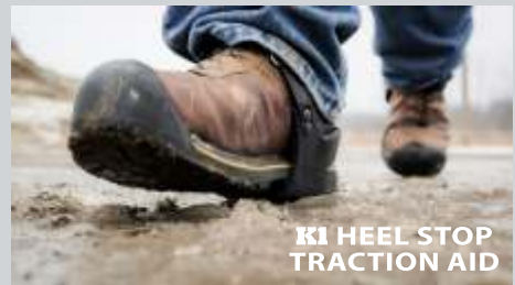
K1 HEEL STOP TRACTION AID