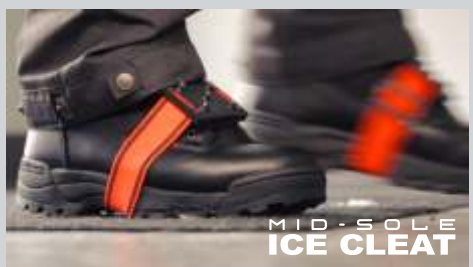
MID-SOLE ICE CLEAT